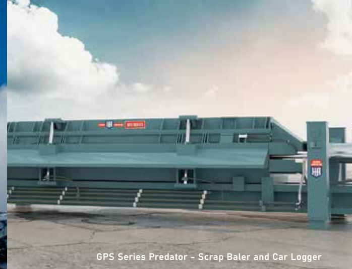
GPS Series Predator - Scrap Baler and Car Logger