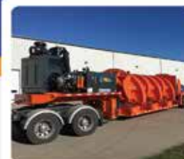
580CL CRANELESS BALER LOGGER