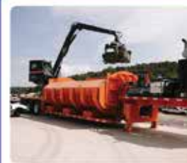
580CL – INDUSTRY LEADING BALER LOGGER