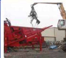
BONFIGLIOLI SQUALO SERIES MOBILE GUILLOTINE SHEAR